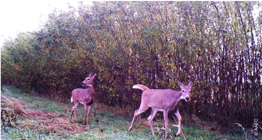
Photo 92. Whitetail deer spotted along Elie Willow Buffer, October 8, 2016