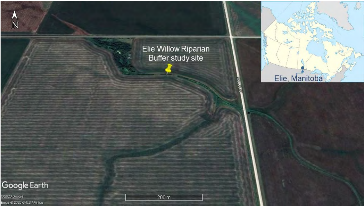
Figure 44. Physical location map of case study site (Latitude: 49°57'29"N, Longitude: 97°55'17"W). Inset-map of Canada with blue dot showing geographical location of Elie, Manitoba.

In this case study, we are focused on soil organic carbon sequestration and present data from the single row 1.0 m spacing planting treatment only.