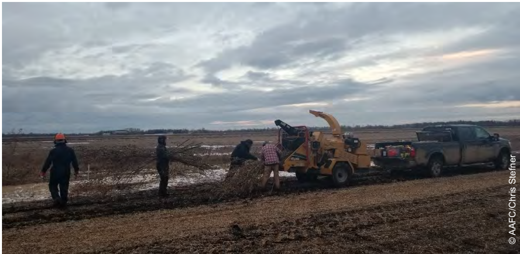
Photo 94. AAFC employees harvesting Elie willow buffer biomass - November 18th, 2019