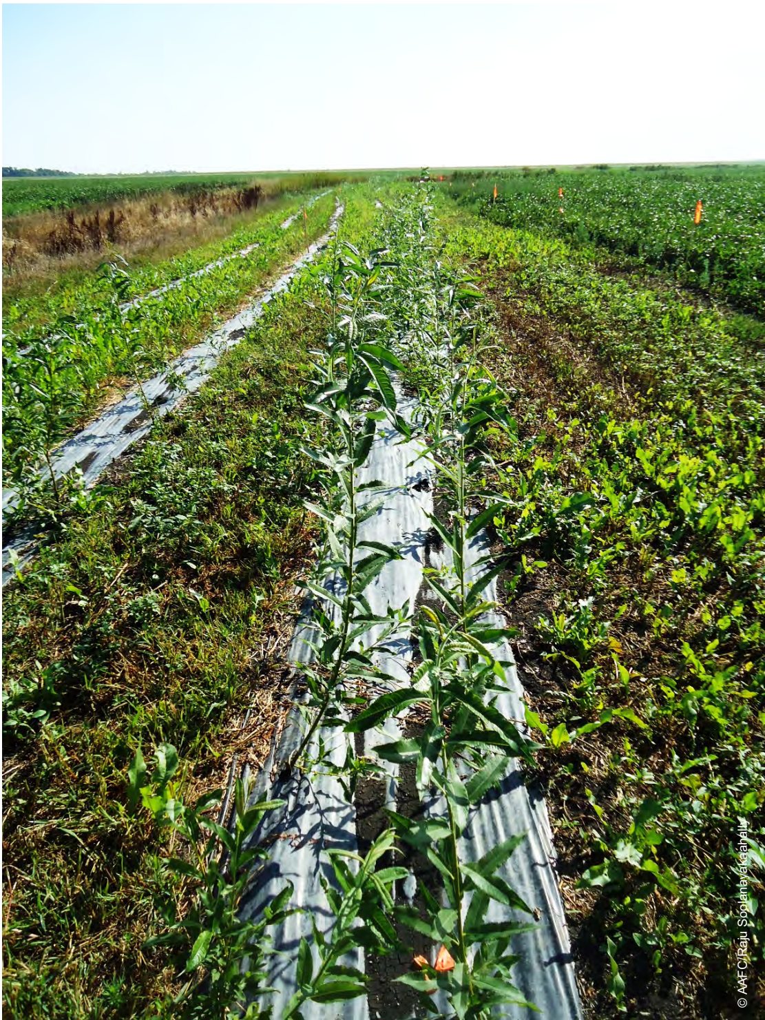
Photo 90. Paired row willow growth at the end of the 2013 establishment year growing season, August 27, 2013