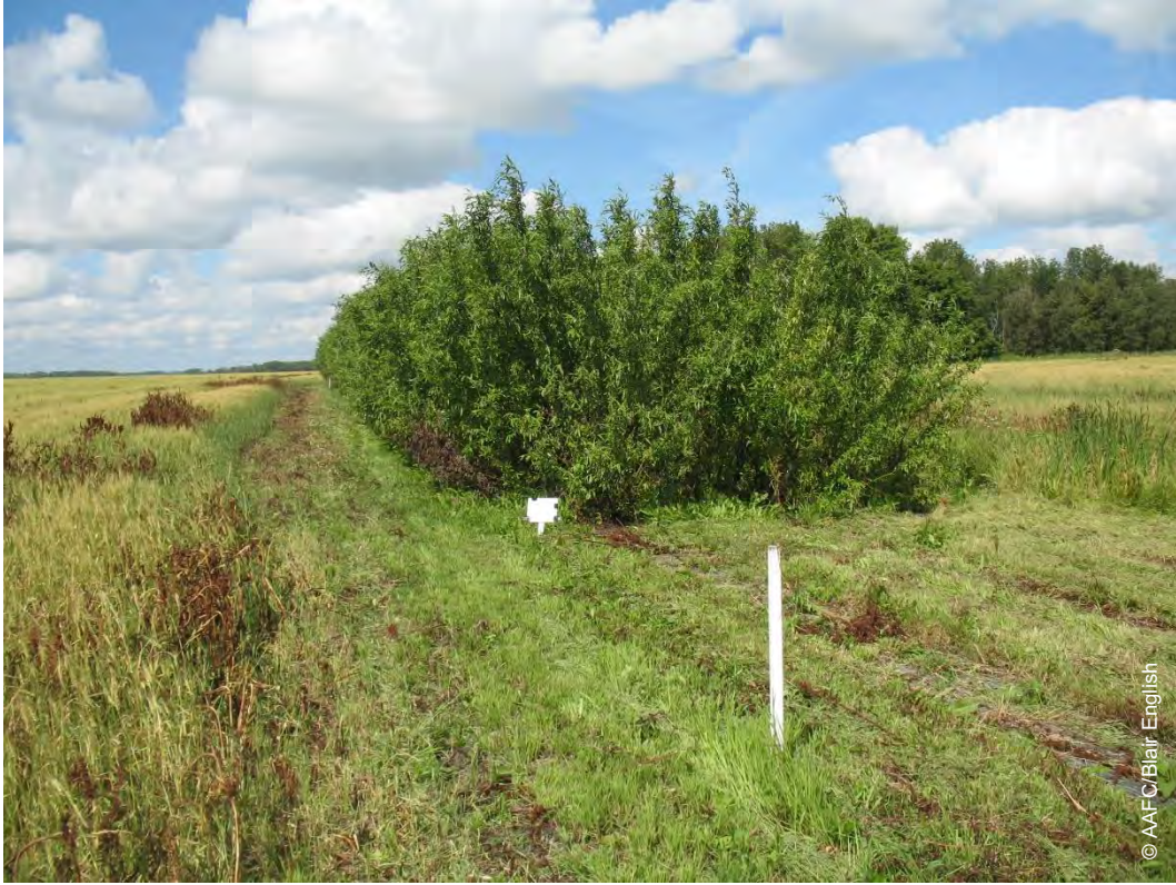
Photo 91. Vegetation growth after three years of establishment, July 26, 2016